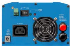
Phoenix Inverter 12/800 with IEC-320 socket