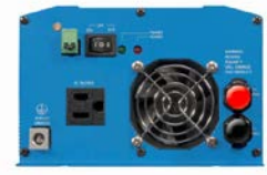
Phoenix Inverter 12/800 with Nema 5-15R socket