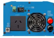
Phoenix Inverter 12/800 with AN/NZS 3112 socket