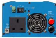
Phoenix Inverter 12/800 with BS 1363 socket