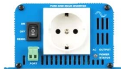
Phoenix Inverter 12/180 with Schuko socket