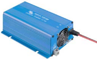
Phoenix Inverter 12/180