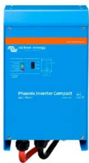
Phoenix Inverter Compact 24/1600

The possibilities of paralleled high power inverters are truly amazing. For ideas, examples and battery capacity calculations please refer to our book 'Energy Unlimited' (available free of charge from Victron Energy and downloadable from www.victronenergy.com ).