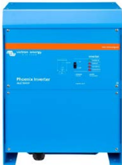
Phoenix Inverter 24/5000